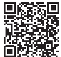
CPS® Inventors Hub

Join CPS® Products to realize your potential, reward innovation, and redefine the industry.