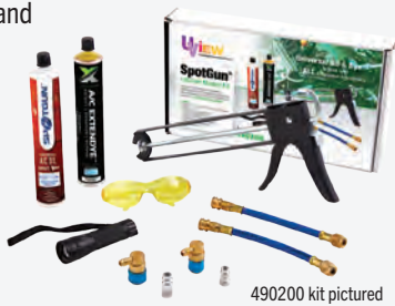
490200 kit pictured