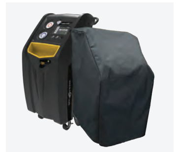
MXXC MX Series Dust Cover