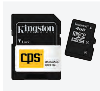
ACDB21 A/C Database SD Card