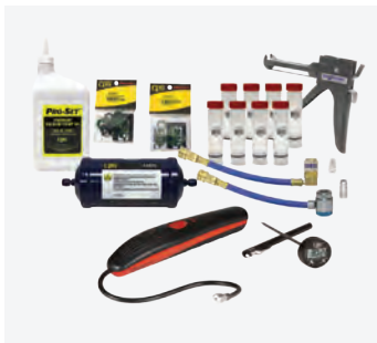
FXP2 FX Series Kits