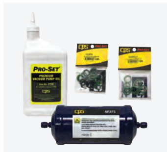
FX3030X1 Filter Maintenance Kit