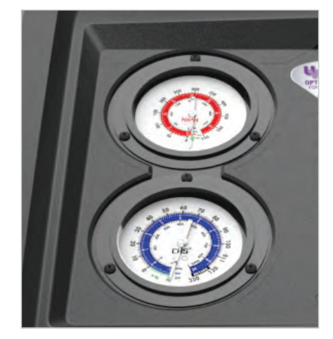
ANALOG 3.5" GAUGES Monitor pressure levels with precision and confidence, ensuring accurate results every time.