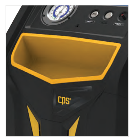
STORAGE COMPARTMENT Efficiency starts with organization. All MaxxAir™ S-Series includes a dedicated storage area for your tools and fittings.