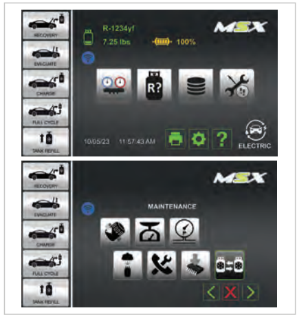
ENHANCED NAVIGATION Easily access all functions and settings at your fingertips, making your refrigerant management tasks a breeze.