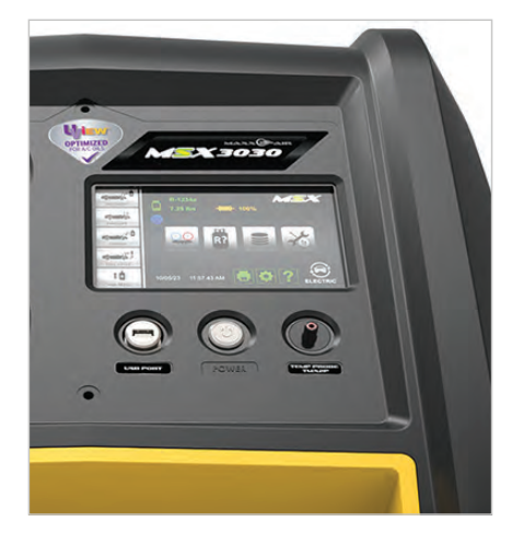
TOUCH-SCREEN LCD DISPLAY Experience a new level of control and precision with our intuitive touch-screen LCD display.