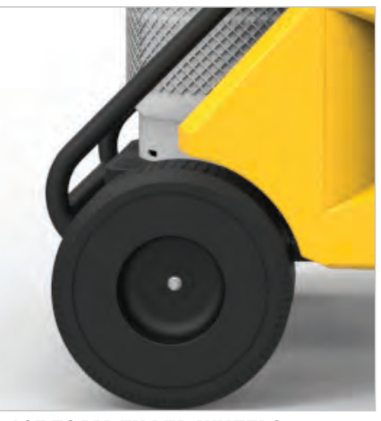
10" FOAM-FILLED WHEELS No need to worry about flat tires or maintenance; these durable wheels ensure smooth mobility, even over rough surfaces.

4" LOCKING SWIVEL CASTERS Lock in place when stability is needed, and unlock for easy maneuverability – giving you complete control over your workspace.